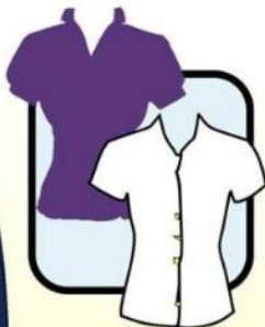
BLOUSE WITH SLEEVES