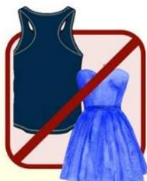
TUBES AND RACERBACKS