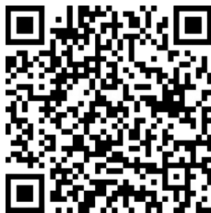
Catholic Welfare Services

DONATIONS FOR THE UNDERPRIVILEGED - Please continue to support the Catholic Welfare Services financially as we minister to the poor and needy in our midst irrespective of race or creed. You may donate to C.W.S. via S Pay Global by scanning this QR code. Verify that the recipient is ' Catholic Welfare Services ' before confirming the transaction. Donations can also be made via online transfer or cash deposit to the following: